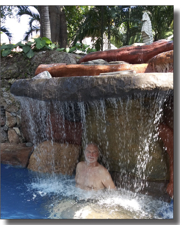
This could be you...