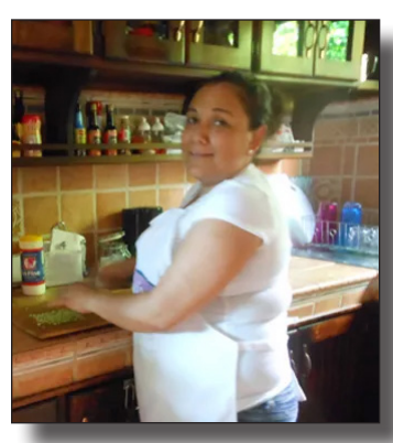
Chelo - Bon Appetite